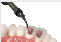
BITE RAMPS & TEMPORARY OCCLUSAL BUILDUPS