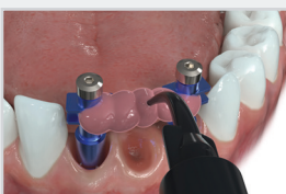
SPLINTING BETWEEN IMPLANT COPINGS